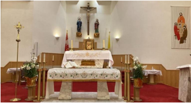
(The above photo-shopped image is an artist's rendering.)