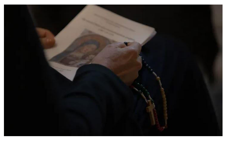
Pope asks Catholics to pray for an end to the Pandemic

Pope Francis has invited Catholics around the world to dedicate the month of May to a marathon of prayer for an end to the Covid-19 pandemic.