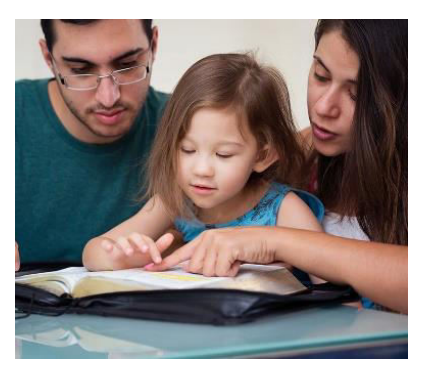
Quality Family Time Contest

Organized by St. Aidan's Parish Knights of Columbus. To enter this contest, provide a written or video submission on how your family has spent quality time together during the pandemic. During the past year, we've all been spending more time with the family in our households and have been separated from our friends and extended families. However, spending more time together doesn't always mean it is quality time connecting as a family. We're looking to share examples of ways families have intentionally spent quality time together during the pandemic. The family with the most interesting, fulfilling, relationshipfamily building event, and presentation, will win a free dinner for their family, which will be delivered to their home by the Knights of Columbus. could be some event you have already done as a family or something you will do before the deadline. It could be as simple as sharing a special meal together or you can be creative. The deadline for entering this contest is Friday July 23rd. See Parish Website for rules and details of this contest.