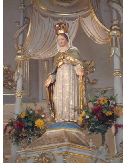
Our Lady of the Cape Shrine Pilgrim Statue