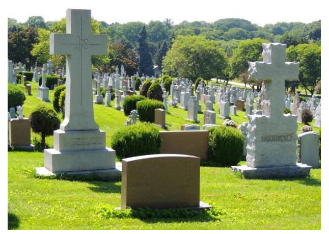
Gaining an Indulgence for your Deceased Loved One

During the month of November, we are called to remember our deceased loved ones and pray that they be released from Purgatory. We will have a box at the front of the church. You can place the names of your loved ones on a piece of paper or envelope and drop it into the box. All the Masses celebrated in November will include everyone whose names are in the box.