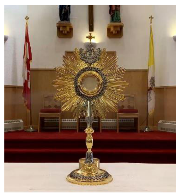
All Night Vigil of Adoration Friday December 3<sup>rd</sup>

After the 7:30 pm Mass on Friday December 3rd we will have an all-night vigil of adoration, with Our Eucharist Lord exposed for our adoration on the altar. The purpose of such an event is to imitate Our Lord who spent entire nights in prayer. This can be done to make reparation for the sins of mankind, to gain graces for oneself and others, and to grow in one's relationship with God. If you are interested, you will need to place your name on the sign-up sheet, available inside the church. For security reasons, we will lock the church doors during the night. Adoration will end just before the morning Saturday 9:00 am Mass.