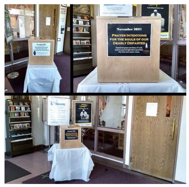
Remembrance of your deceased loved ones

During the month of November, we are called to remember our deceased loved ones and pray that they be released from Purgatory. We will have a box at the front of the church. You can place the names of your loved ones on a piece of paper or envelope and drop it into the box. All the Masses celebrated in November will include everyone whose names are in the box.