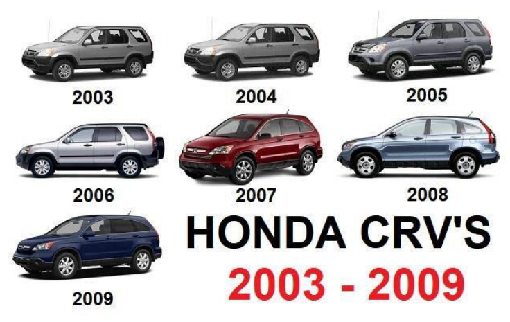
Muffler stolen in our Parking Lot

If you own a Honda CRV 2003 to 2009, please be very careful. One of our parishioners with such a car had his catalytic converter (muffler) stolen while parked in the parish parking lot. Thieves can cut through the metal pipes in a couple of minutes with an electric power saw. These CRV's are primary targets because they are higher off the ground, and so easier to access, and the piping is easy to get at based on the design. We suggest that you park in such a way that you do not back into your spot. Someone under your car is easier to spot if the back end of your car is visible. To replace your catalytic converter would cost you roughly $1000-$2000.