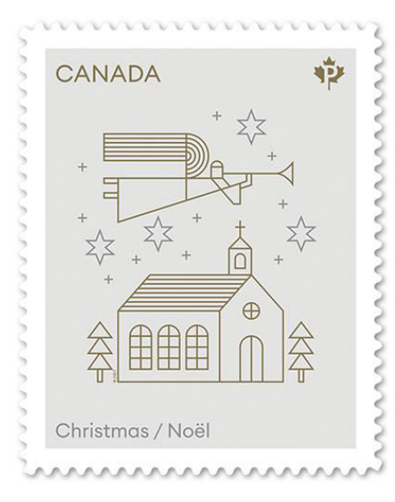
Christmas Nativity Stamps

Every year Christmas Nativity Stamps are available for purchase from Canada Post. This is due to The Catholic Women's League of Canada. At their 85th annual National Convention in 2005 they urged Canada Post to include a Nativity-related theme in future Christmas stamps. As Catholics we are very privileged to have these annual religious stamps produced by Canada Post, however, this tradition must be supported by us in order for it to continue. Unfortunately, if you just ask for stamps, you will not be given these stamps, instead it will be stamps of Santa's Elves or something else. <u>Please ask for the Nativity Stamps.</u> The 2021 stamp honours the angels that played a central role in the Nativity story according to the Gospel of Luke.