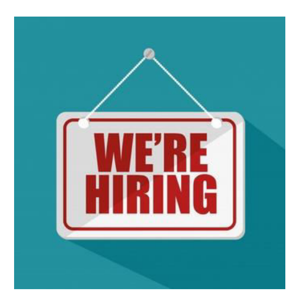
Hiring a Lay Pastoral Assistant

St. Aidan Parish will have a Christmas Liturgy for Children ages 4 to 8 on Sunday December 19 at the 10:30 am Mass. The program is approximately 20 minutes, after which the children return to their parents to join the Liturgy of the Eucharist. The children will receive a small Christmas gift. Parents are asked to pre-register their children this weekend in the foyer during weekend Masses on December 11-12.