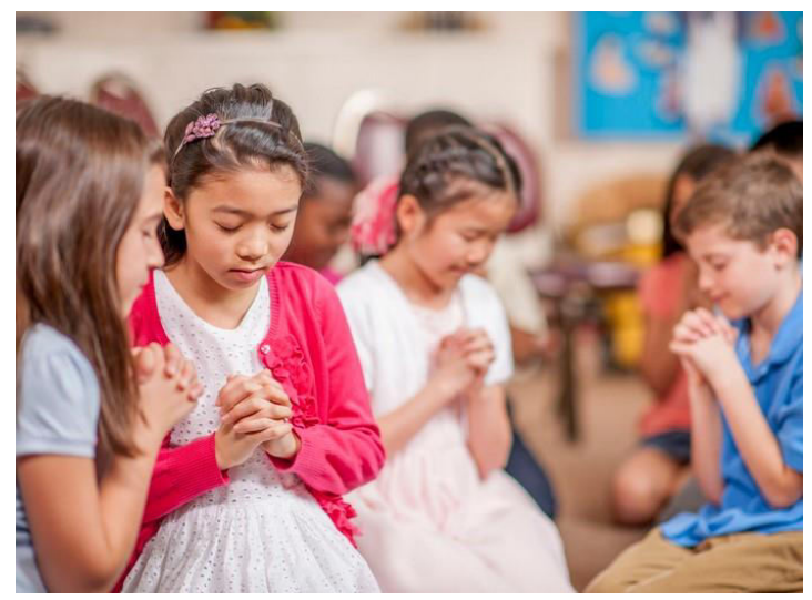
Children's Christmas Liturgy

St. Aidan Parish will have a Christmas Liturgy for Children ages 4 to 8 on Sunday December 19 at the 10:30 am Mass. The program is approximately 20 minutes, after which the children return to their parents to join the Liturgy of the Eucharist. The children will receive a small Christmas gift. Parents are asked to pre-register their children this weekend in the foyer during weekend Masses on December 11-12.