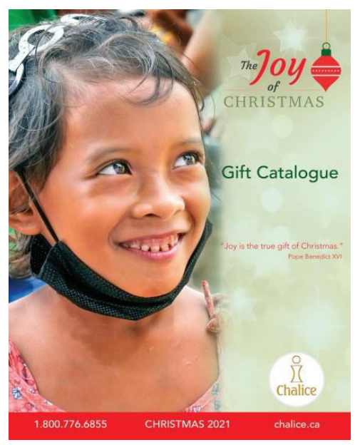
Chalice Gift Catalogue; to Help Needy Children in Poor Countries

A Raffle of two St. Joseph Statues will be conducted by the Catholic Women's Group of our parish. Tickets are one for $2, or three tickets for $5. Tickets can be purchased after all Sunday Masses. The draw will take place this Sunday December 12th after the 12 noon Mass. All proceeds will be in support of the Saint Vincent de Paul Society-St. Aidan's Conference.