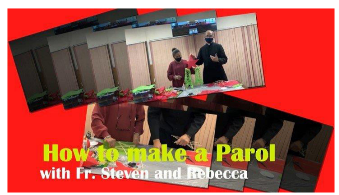
Simbang Gabi Christmas Lantern (Parol) Making Contest

The Filipino community of St. Aidan's Parish would like to invite everyone to embrace their "beautiful gift" of Simbang Gabi. This is a Filipino Christmas tradition; a series of nine dawn Masses on the days leading up to Christmas, from December 16th to December 24th. The tradition goes back to colonial times, during Spanish rule, when Catholic priests started offering Mass very early in the morning so that farmers could attend morning Mass and still be at work before sunrise. Join us in preparing for the birth of Our Lord through this novena of prayer and sacrifice by participating in the nine Simbang Gabi Masses from December 16-24 at 6:00 am, at St. Aidan's church. After each 6:00 am Mass, a reception of coffee/tea and traditional Filipino foods will be available to eat or bring home. Everyone is welcome. Note that you will need to pre-register online for these Masses. Registration is accessible at this time.