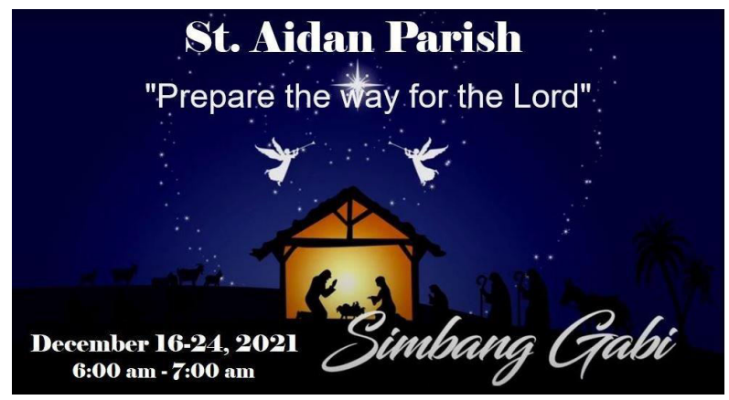
Simbang Gabi Novena of Masses - December 16-24

The Filipino community of St. Aidan's Parish would like to invite everyone to embrace their "beautiful gift" of Simbang Gabi. This is a Filipino Christmas tradition; a series of nine dawn Masses on the days leading up to Christmas, from December 16th to December 24th. The tradition goes back to colonial times, during Spanish rule, when Catholic priests started offering Mass very early in the morning so that farmers could attend morning Mass and still be at work before sunrise. Join us in preparing for the birth of Our Lord through this novena of prayer and sacrifice by participating in the nine Simbang Gabi Masses from December 16-24 at 6:00 am, at St. Aidan's church. After each 6:00 am Mass, a reception of coffee/tea and traditional Filipino foods will be available to eat or bring home. Everyone is welcome. Note that you will need to pre-register online for these Masses. Registration is accessible at this time.