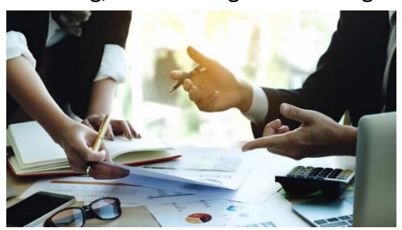
Calling all Catholic Advisors

If you are interested in live streaming a church event, we are asking for $300 to help us cover the costs of purchasing, maintaining and running the equipment.