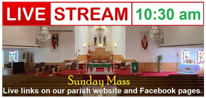
Live Streaming of Sunday 10:30 am Mass

For information on how to enroll, please contact your parish office or email development@archtoronto.org