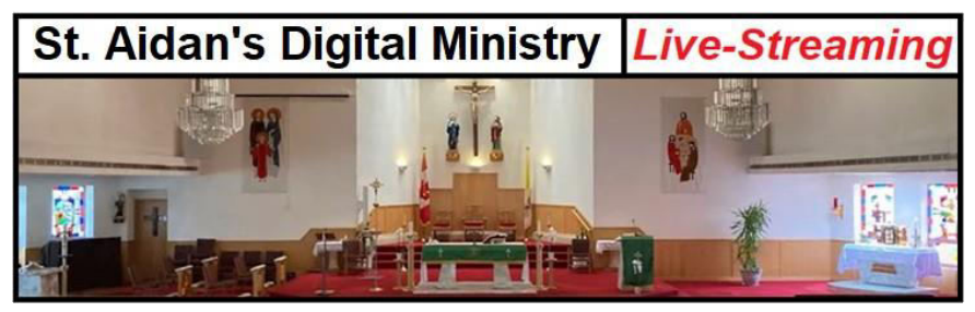
Live Streaming of Weddings or Funerals

If you are interested in live streaming a church event, we are asking for $300 to help us cover the costs of purchasing, maintaining and running the equipment.