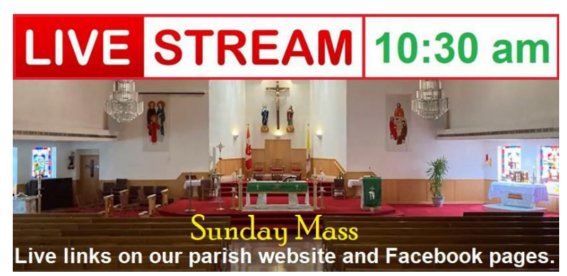
Live Streaming of Sunday 10:30 am Mass

The Knights of Columbus are inviting families and all parishioners to join in a Consecration to the Holy Family on the Family Day weekend (February 19-20). This is a way of entrusting your family and yourself to the intercession and protection of the Holy Family. If you've already done the consecration in the past, this is an opportunity to renew it and meditate deeper on the life of the Holy Family. The prayer can be found on our staidansscarchtoronto.org website.