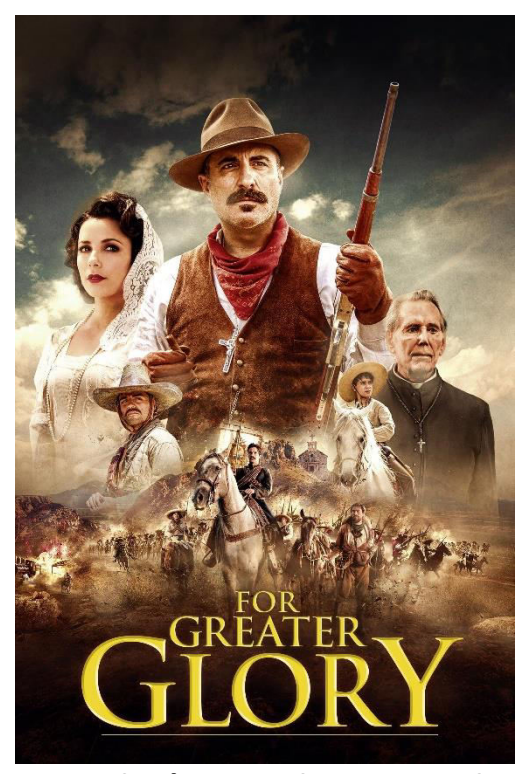
St. Aidan's Virtual Movie Night

On Saturday February 19th at 7:00 pm we will be showing the movie, "For Greater Glory" which is based on the true story of the persecution of Catholics in Mexico during the 1920's and their attempts to defend themselves and their beliefs. This event is being brought to you by the Knights of Columbus of St. Aidan's Parish. Please join us for the movie and the discussions that follow. The Zoom link will be on our parish website.