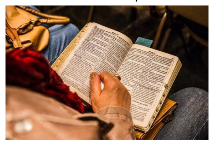
Bible Study at St. Aidan's

On Saturday February 19th at 7:00 pm we will be showing the movie, "For Greater Glory" which is based on the true story of the persecution of Catholics in Mexico during the 1920's and their attempts to defend themselves and their beliefs. This event is being brought to you by the Knights of Columbus of St. Aidan's Parish. Please join us for the movie and the discussions that follow. The Zoom link will be on our parish website.