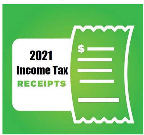
Your Offertory Income tax receipts for 2021 are ready

If you test positive for Covid, please let us know. Let us know when you started to develop symptoms and when was the last time you came to Mass. We may need to notify parishioners who were present at that Mass. Your identity will be kept confidential.