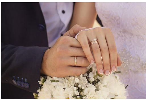
Marriage Preparation Course

For more information on how to enroll, <u>please contact your parish</u> or email <u>development@archtoronto.org</u>.