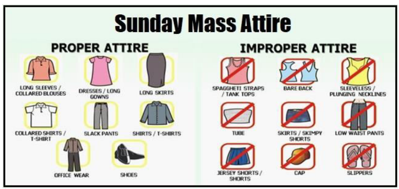
Who, or what are you dressing for?

Our Catholic tradition is that we <u>dress up nice for Sunday Mass</u>. This may be somewhat uncomfortable for some people, but we do it to honour Our Eucharistic Lord. If you had a meeting or gathering with the Queen of England, would you dress for comfort, or to appeal to the opposite sex? Would you appear as if you were going to the beach or to the park? The Queen of England is as nothing compared to the King of Kings, Jesus Christ, truly present in every Catholic Church. If we make our Sunday Mass attendance an occasion to celebrate our meeting with Jesus, and we do it with great dignity, including how we dress, then God will bless our efforts to honour Him and we will be a good example to those around us.