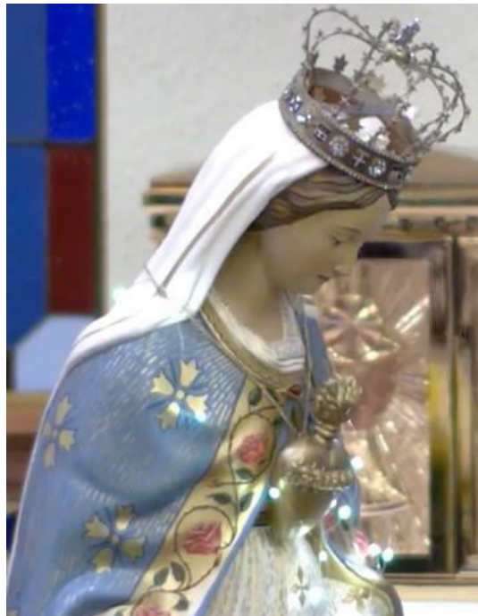
Our Lady of the Cape Pilgrim Statue

Please note that the Sunday 10:30 am Mass will be regularly live-streamed.