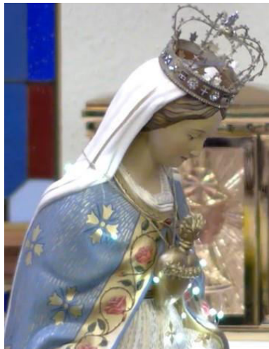
Our Lady of the Cape Pilgrim Statue

Our Catholic tradition is that we dress up nice for Sunday Mass . This may be somewhat uncomfortable for some people, but we do it to honour Our Eucharistic Lord. If you had a meeting or gathering with the Queen of England, would you dress for comfort, or to appeal to the opposite sex? Would you appear as if you were going to the beach or to the park? The Queen of England is as nothing compared to the King of Kings, Jesus Christ, truly present in every Catholic Church. If we make our Sunday Mass attendance an occasion to celebrate our meeting with Jesus, and we do it with great dignity, including how we dress, then God will bless our efforts to honour Him and we will be a good example to those around us.