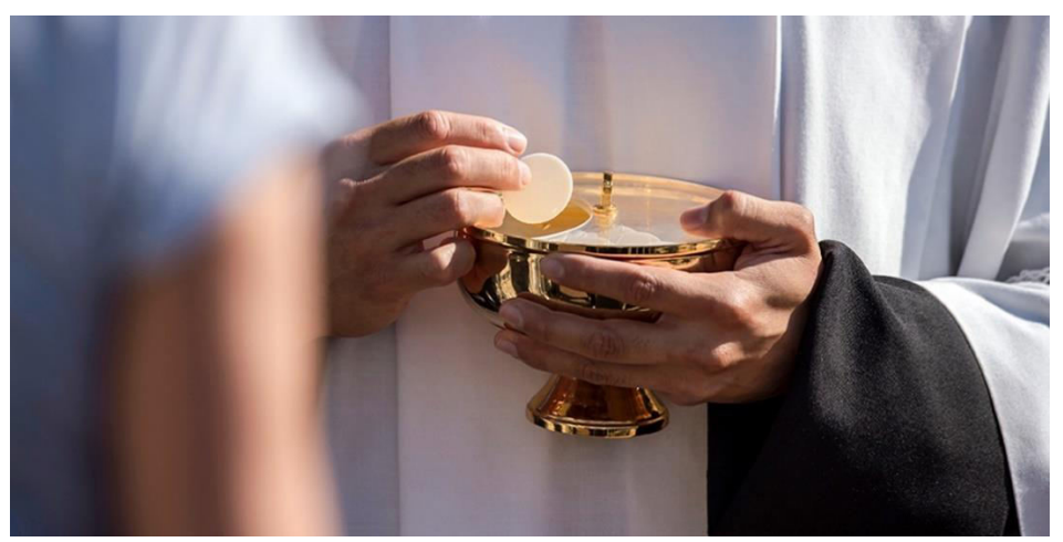
Not Married in the Catholic Church

Municipal elections will be held on Monday, October 24. As Catholics, need to know what our candidates stand for. This is especially true regarding Catholic School Trustees. These Trustees will determine the policies guiding our Catholic Schools and what is taught to our children. If we fail to vote for Trustees who truly support Catholic Teachings and Values, we could be doing immeasurable harm to young children for many generations to come. Please make the effort to know what the Trustees in your area stand for. For additional guidance, check the Campaign Life Coalition website, since they usually have excellent analysis of candidates for upcoming elections. To ensure your vote for Catholic School Board Trustee, at the polling booth, verify that you are registered as a separate school supporter. If your support status is incorrect, ask for an Application to Amend Voters #39 List. This form may be completed and submitted at the polling station.