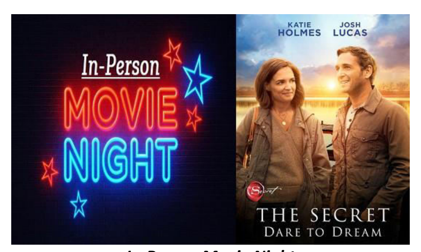
In-Person Movie Night

Edge is a Catholic middle school youth ministry program for students ages 11-14. Edge provides a safe and fun place for youth to find a solid Catholic community, to get answers to their questions about faith or morals, and, most importantly, to experience Jesus in a profound and personal way. The first meeting will be on Saturday, October 15th at 3:30 pm (before the 5 pm Mass), and will run every other week thereafter up to December 10th. After that, we will then go into recess until after the New Year. Youth are asked to bring a Bible and a pen to the meetings. Everything else will be provided. Sign-ups are open now, and parents are asked to register their kids through the link found on the parish website (staidanssc.archtoronto.org).