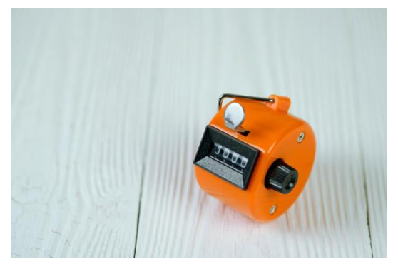
Annual Attendance Head Count

Parish attendance survey for all parishes will be conducted on the weekends of October 15/16 and October 22/23. The Ushers will be conducting the head count during Mass.