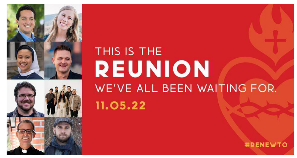
RENEW Toronto Young Adult Conference 2022

We are very excited to be bringing young adults together again for RENEW Toronto . RENEW Toronto is a conference for all young adults aged 19-39 with keynotes, workshops, worship music, Confession, Mass, Eucharistic Adoration, and fellowship. This conference will offer unique opportunities for students, young adult professionals, and young couples. We invite young adults to unite with one another to collectively renew their hearts, renew their call and renew their community. <a href="Saturday November 5">Saturday November 5</a>, 10 am to 8:30 pm. (Social until 11 pm.) <a href="Canada Christian College">Canada Christian College</a> (300 Water St., Whitby). For more information and to register, visit our website <a href="www.renewtoronto.org">www.renewtoronto.org</a> or contact us at <a href="youngadult@ocytoronto.org">youngadult@ocytoronto.org</a>.