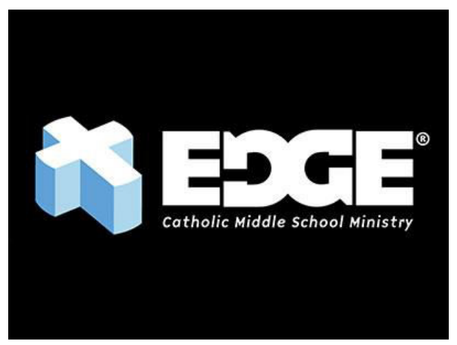
EDGE for youth ages 11 to 14

Edge is a Catholic middle school youth ministry program for students ages 11-14. Edge provides a safe and fun place for youth to find a solid Catholic community, to get answers to their questions about faith or morals, and, most importantly, to experience Jesus in a profound and personal way. The first meeting will be on Saturday, October 15th at 3:30 pm (before the 5 pm Mass), and will run every other week thereafter up to December 10th. After that, we will then go into recess until after the New Year. Youth are asked to bring a Bible and a pen to the meetings. Everything else will be provided. Sign-ups are open now, and parents are asked to register their kids through the link found on the parish website (staidanssc.archtoronto.org).