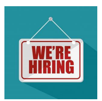
Hiring a New Custodian

There will be a second collection on October 22/23 for the Evangelization of the Nations, otherwise known as World Mission Sunday. This is a worldwide collection for the missionary church and it is our opportunity to assist at-need Catholic communities globally. Offerings are combined with offerings from other Catholics around the world and distributed to missions and dioceses. We are called to share from our abundance with those less fortunate who lack the basic essentials to know, love and praise God. Thank you for your support of this important work. Envelopes for this collection are at the back of the church.