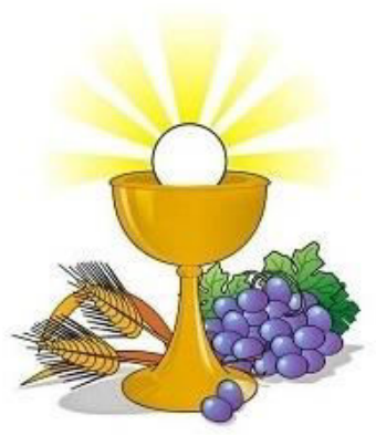
First Reconciliation and First Holy Communion

Classes for First Reconciliation will begin on <u>Sunday</u>, <u>October 23rd</u>, <u>right after the 12 noon Mass</u>. There will be a mandatory information session for parents this <u>Sunday October 16th</u>, <u>which is also right after the 12 noon Mass</u>. These classes are intended for children in Grades 2 and 3. Each class will be about an hour long. <u>Registration forms are available on our parish</u> <u>website</u> or can be picked up from the Gift Shop of the Office during office hours.