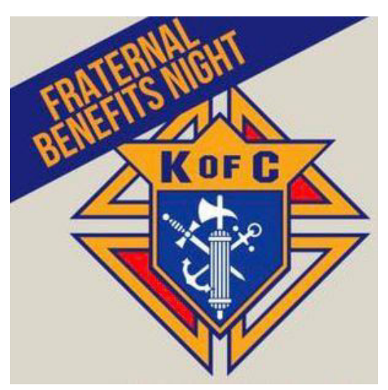
Knights of Columbus Fraternal Benefits Night