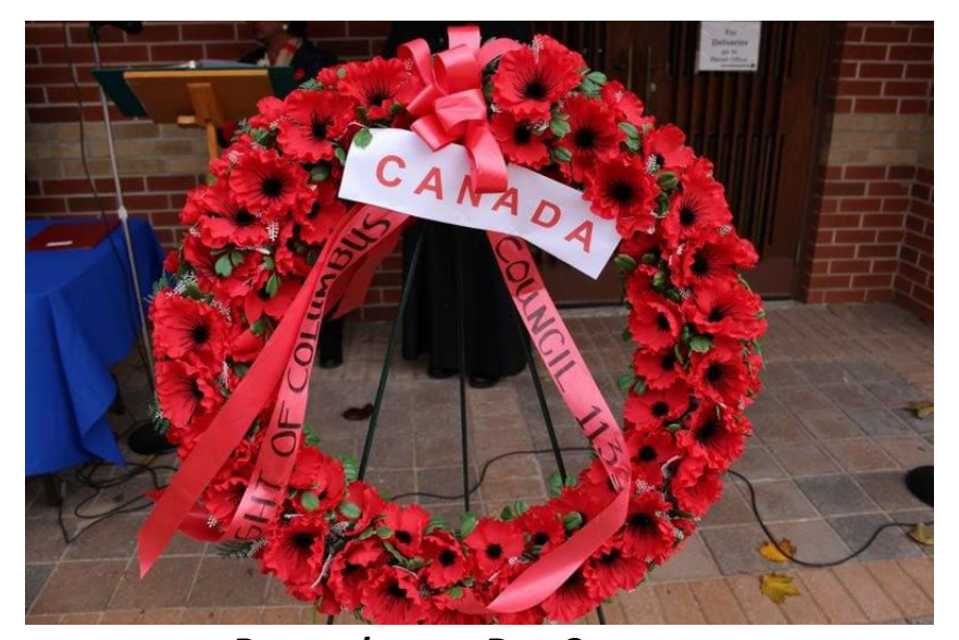
Remembrance Day Ceremony

On Friday November 11, the Knights of Columbus, Bishop Greco Assembly, are organizing a Remembrance Day Marching ceremony in our parish parking lot. The ceremony will begin at 10:45 a.m. During this time, there will be no access to vehicles in the parking lot. You would need to park before 10:45 a.m. All parishioners are welcome to attend the ceremony.