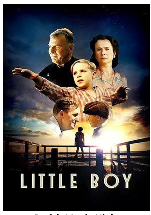
Parish Movie Night