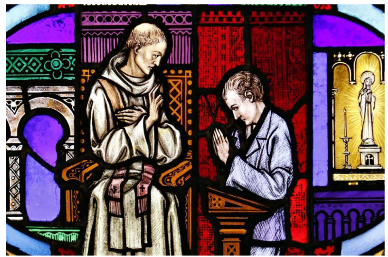
Advent Parish Confessions