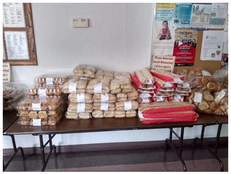
Free Bread Friday Evenings

Please come to the church Gift Shop after any of the Sunday Masses to pick up your income tax receipt.