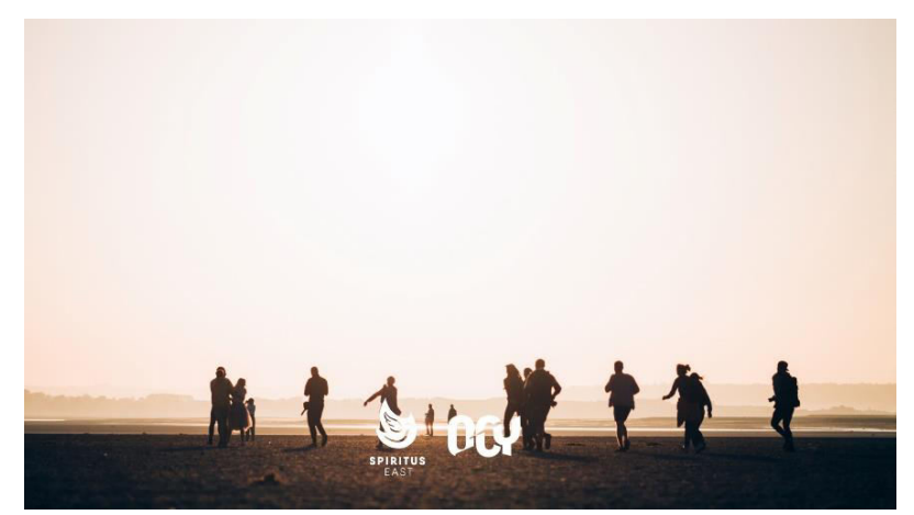
Spiritus East Young Adult Ministry (Ages 19-35): "The Vocation of Man & Woman." Talk // Small Group // Fellowship.

ShareLife Sunday is March 26. Our parish goal for this year's campaign is $58,600.00. More than 40 Catholic organizations and social service agencies are supported through your generosity. Without your contributions, more than 150,000 people would not receive the hope offered through the vital work of these agencies. Please give at the parish using a ShareLife envelope, <u>online through parish website</u>, or at <u>sharelife.org/donate</u>.