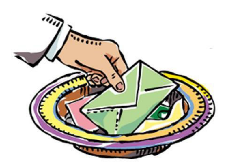
Second Collection this Weekend

If you wanted to contribute to the humanitarian aid for the victims of the recent earthquake, you can do so directly through the Archdiocese of Toronto Website, or by phone through the Development Office 416-934-3411, or through St. Aidan's Parish by cheque payable to: St Aidan Church-Turkey and Syria Earthquake - Humanitarian Relief.