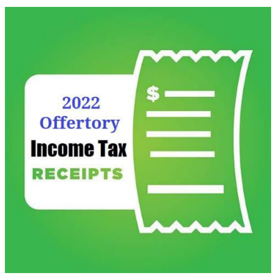
Your Offertory Income Tax Receipts for 2022 are ready

Please come to the church Gift Shop after any of the Sunday Masses to pick up your income tax receipt.