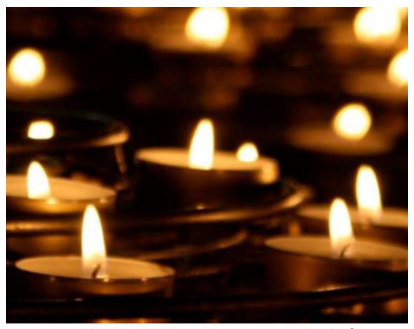
Turkey and Syria Humanitarian Relief

If you wanted to contribute to the humanitarian aid for the victims of the recent earthquake, you can do so directly through the Archdiocese of Toronto Website, or by phone through the Development Office 416-934-3411, or through St. Aidan's Parish by cheque payable to: St Aidan Church-Turkey and Syria Earthquake - Humanitarian Relief.