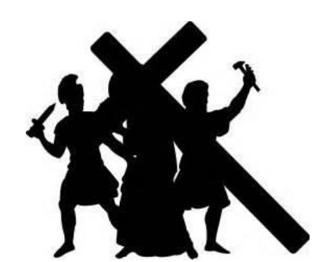
Stations of the Cross During Lent

Email: <a href="mailto:vocations@archtoronto.org">vocations@archtoronto.org</a> or <a href="https://www.vocationstoronto.ca/">https://www.vocationstoronto.ca/</a>