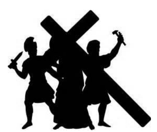
Good Friday Stations of the Cross By St. Aidan Youth

Let us reflect on Christ's Passion & Death on Good Friday by walking the sorrowful journey with Him. All parishioners are invited to attend the Stations of the Cross on Good Friday, April 7, at 7:30 pm.