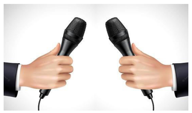
Question and Answer Session

After the 5:00 pm Mass on Saturday April 1st, we will have an outdoor procession around the church and school, weather permitting. We will pray the Rosary as we walk.