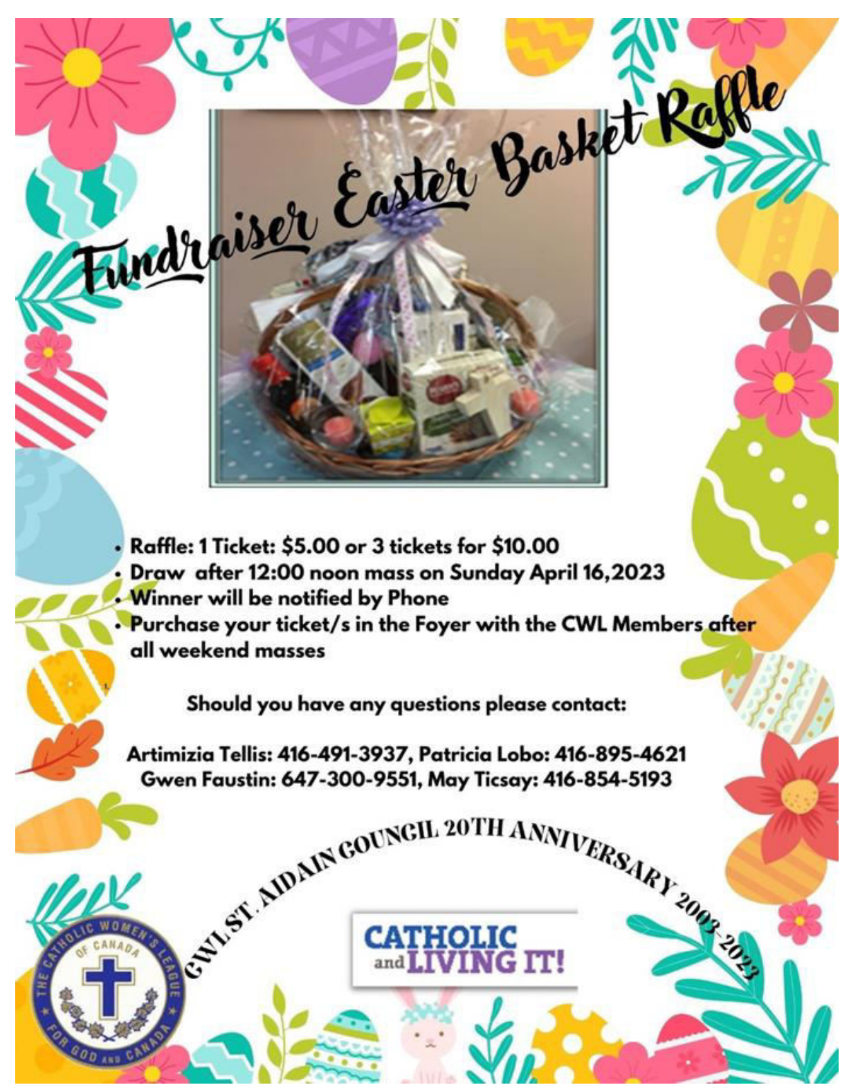
Raffle of Easter Basket

The <u>CWL</u> of our parish are conducting a fundraiser by raffling off an Easter Basket. Tickets are 1 for $5, or 3 tickets for $10. Tickets can be purchased in the foyer after all weekend Masses. The draw will take place after the 12 noon Mass on Sunday April 16th .