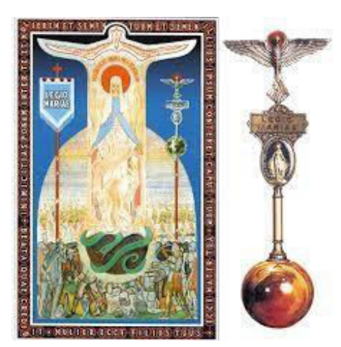
Legion of Mary Acies

Email: vocations@archtoronto.org or https://www.vocationstoronto.ca/