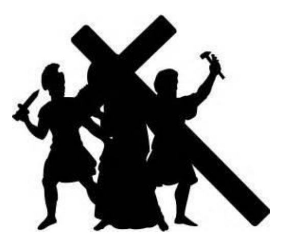
Stations of the Cross During Lent